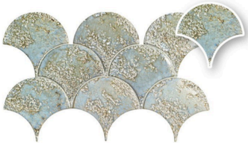
PAI PAI JADE 12,7 x 6,2 (G 81) 5" x 2,5" m²