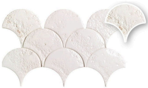
PAI PAI WHITE 12,7 x 6,2 (G 81) 5" x 2,5" m²

RELIEVES IRREPETIBLES UNIQUE RELIEFS RELIEFS IRRÉPÉTIBLES