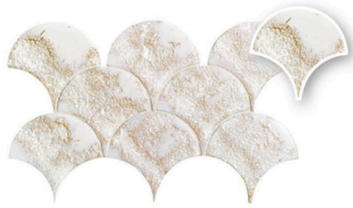
PAI PAI MOONSTONE 12,7 x 6,2 (G 81) 5" x 2,5" m²