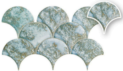
PAI PAI SAPHIRE 12,7 x 6,2 (G 81) 5" x 2,5" m²